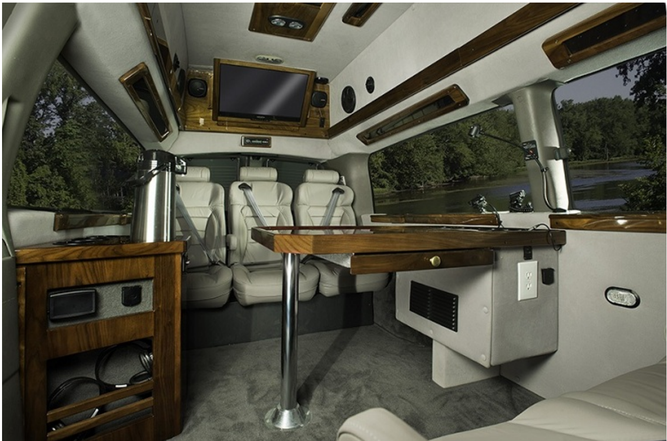
This is a comfortable layout for Executive Transport.