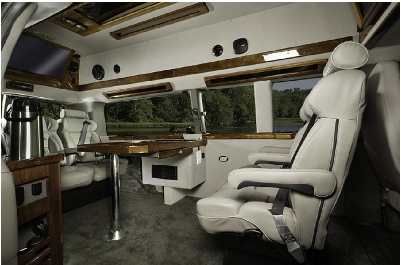
Coffee Dry Bar and Stereo Components